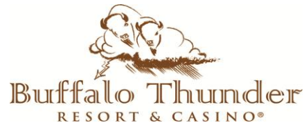
Buffalo Thunder Casino