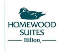
Homewood Suites Santa Fe North