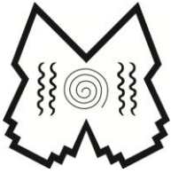
The Pueblo of Pojoaque Businesses